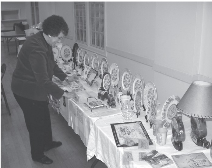
The author with her collection

Although I say I’m no longer collecting, somehow a piece I haven’t seen shows up—and, well, you know the rest of the story.