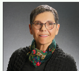
Third Gen Roseway Resident